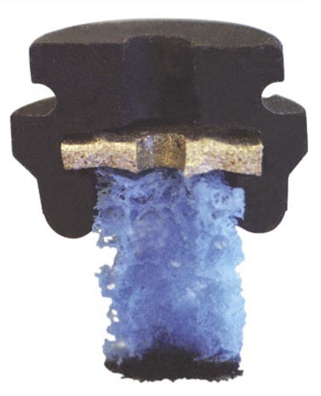
QuikCell expanded after hydration